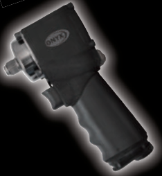
MODEL NO. 1822 ONYX 1/2" NANO IMPACT WRENCH - 450FT/LB