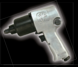
MODEL NO. 1812 1/2" SUPER DUTY IMPACT WRENCH - TWIN HAMMER