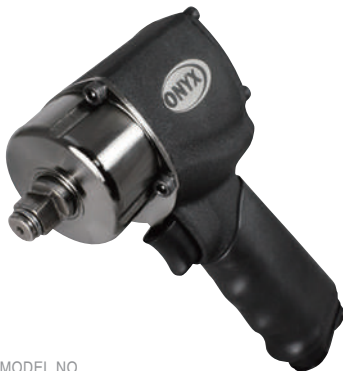
MODEL NO. 1823 ONYX 1/2" NANO IMPACT WRENCH - 625FT/LB