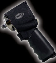
MODEL NO. 1828 ONYX 3/8" NANO IMPACT WRENCH - 450FT/LB