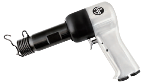
MODEL NO. 4980 0.498" SHANK SUPER DUTY AIR HAMMER / RIVETER