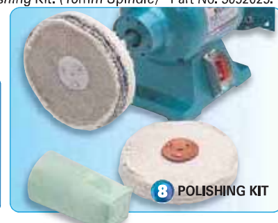
8 POLISHING KIT

CBK200C - 8" Polishing Kit. (16mm Spindle) - Part No. 3052025.