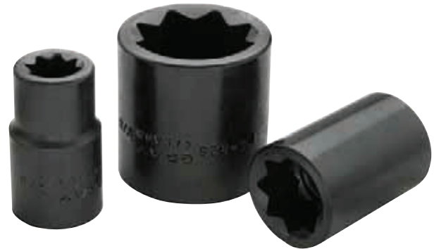
Double Square Standard Length Impact - Black Industrial Finish