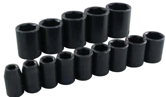
35064 14 Pieces 6 Point Standard SAE Impact Socket Set

Contains: 3/8", 7/16", 1/2", 9/16", 5/8", 11/16", 3/4", 13/16", 7/8", 15/16", 1", 1 1/16", 1 1/8", 1 1/4"