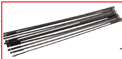
9 297/P 15tpi COPING SAW BLADES

Pinned end blades supplied on display cards of ten. For use with Stock No.18052 and 64408 Coping Saws and other manufacturers coping saws. Display packed.