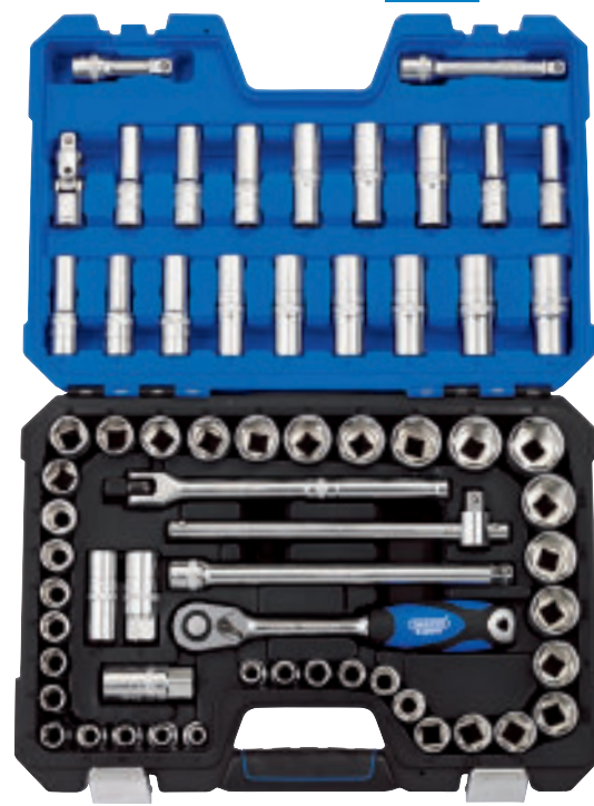
3 H63AMN/SG 1/2" Sq. Dr. MM/AF COMBINED SOCKET SET (63 PIECE) Manufactured and tested generally in accordance with DIN3122 and ISO3315 Specifications

Expert Quality , six point sockets made from chrome vanadium steel that's hardened and tempered with a micro satin finish. Each socket has a knurled ring for extra grip. Supplied with a 72 tooth reversible soft grip ratchet and accessories. Packed in a tough plastic storage case with soft grip handle.