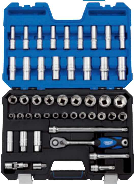
2 H48MN/SG 1/2" Sq. Dr. METRIC SOCKET SET (48 PIECE) Manufactured and tested generally in accordance with DIN3122 and ISO3315 Specifications

Expert Quality , six point sockets made from chrome vanadium steel that's hardened and tempered with a micro satin finish. Each socket has a knurled ring for extra grip. Supplied with a 72 tooth reversible soft grip ratchet and accessories. Packed in a tough plastic storage case with soft grip handle.