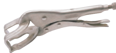
3 9000S 280mm SELF GRIP WELDING CLAMP Manufactured from good quality steel, nickel plated, with quick release lever. Display carton.