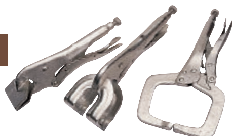
4 9013K SELF GRIP WELDING CLAMP KIT (3 PIECE) Manufactured from good quality steel, nickel plated, with quick release lever. Display carton. Contents: • 250mm Sheet Metal Clamp • 225mm Welding Clamp • 280mm C Clamp