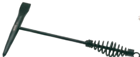
9 WH/L WELDERS HAMMER Hardened and tempered head with steel spring impact resistant handle. Sold loose.

Stock No. Dimensions L x W x H 82330 118 x 13 x 82mm