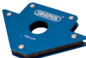
7 WM-2/B MULTI-PURPOSE MAGNETIC HOLDER For holding workpieces whilst soldering or welding. Working angles: 45°, 75° and 135°. Manufactured from high quality pressed and enamelled steel with strong magnet. Display packed.

Stock No. Dimensions L x W x H 24577 95 x 13 x 65mm