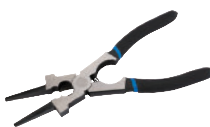
5 WP2 210mm SOFT GRIP MIG 'HELPER' PLIERS Aids MIG welding including removal of spatter from in and around the shroud, drawing out and cutting off wire and removing contact tips and shrouds. Spring-loaded jaws with soft grip handles. Display packed.