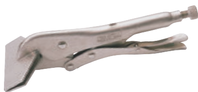
1 9010S 240mm SELF GRIP SHEET METAL CLAMP Manufactured from good quality steel, nickel plated, with quick release lever. Display carton.