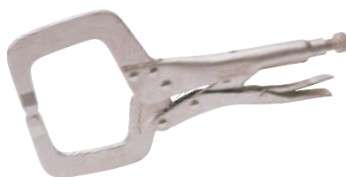
2 9020S 280mm SELF GRIP C CLAMP Manufactured from good quality steel, nickel plated, with quick release lever. Display carton.