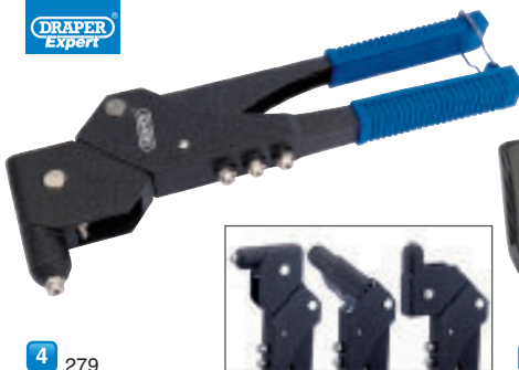
4 279 360° RIVETER

Expert Quality. aluminium head and body. Supplied with four nozzles to accept 2.4 3.2, 4.0 and 4.8mm aluminium rivets. Steel handle clip acts as nozzle change wrench. Display packed.