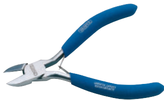
3 38A 110mm CARBON STEEL DIAGONAL SIDE CUTTERS

Carbon steel, hardened and tempered with textured grips, captive double leaf springs and bevel cut induction hardened cutting edges. Display packed.