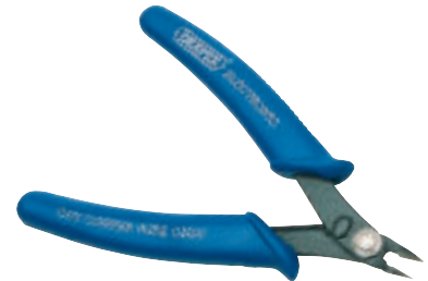
7 31A 130mm FLUSH CUT ELECTRONICS NIPPERS

Carbon steel, hardened and tempered for cutting copper wire up to 1.2mm diameter. Chemically blacked finish with soft grips and limiter feature. Display packed.