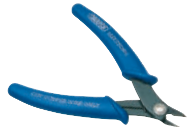
8 32A 130mm THIN JAW ELECTRONICS NIPPERS

Carbon steel, hardened and tempered for cutting copper wire up to 1.2mm diameter. Chemically blacked finish with soft grips and limiter feature. Display packed.