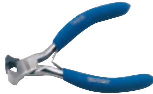
4 38A 105mm CARBON STEEL END CUTTING PLIERS

Carbon steel, hardened and tempered with textured grips, captive double leaf springs and bevel cut induction hardened cutting edges. Display packed.