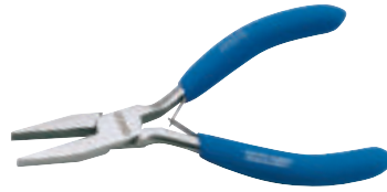
5 38A 125mm CARBON STEEL FLAT NOSE PLIERS

Carbon steel, hardened and tempered with textured grips, captive double leaf springs and smooth jaws. Display packed.