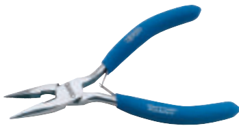
1 38A 125mm CARBON STEEL LONG NOSE PLIERS

Carbon steel heads chemically blacked with wire limiter