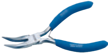
2 38A 125mm CARBON STEEL BENT NOSE PLIERS

Carbon steel, hardened and tempered with textured grips and captive double leaf springs. Jaws angled up to 30°. Display packed.