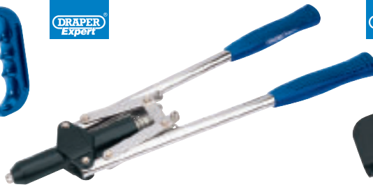
2 269B LONG ARM RIVETER

Expert Quality. compound action riveter with spring action tubular steel handles and rubber soft grips. Supplied with nozzle wrench for use with the three interchangeable nozzles, which accept 3.2, 4.0 and 4.8mm alloy and blind rivets. Carton packed.