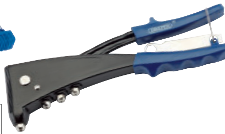
5 266A RIVETER

General duty riveter with cast aluminium body. Supplied with nozzle wrench for use with the four interchangeable nozzles, which accept 2.4, 3.2, 4.0 and 4.8mm alloy and blind rivets. Carton packed.