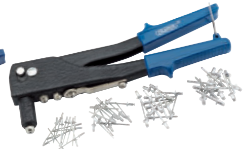
6 265KA RIVETER WITH RIVETS

DIY users riveter with blue enamelled pressed steel frame, chrome molybdenum steel jaws and moulded grip handles. Supplied with four nozzles to accept 2.4, 3.2, 4.0 and 4.8mm aluminium alloy blind rivets, plus an assortment of approximately 60 rivets. Display packed.