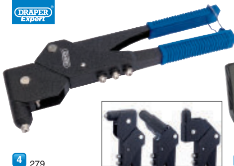
4 279 360° RIVETER

Expert Quality. aluminium head and body. Supplied with four nozzles to accept 2.4 3.2, 4.0 and 4.8mm aluminium rivets. Steel handle clip acts as nozzle change wrench. Display packed.