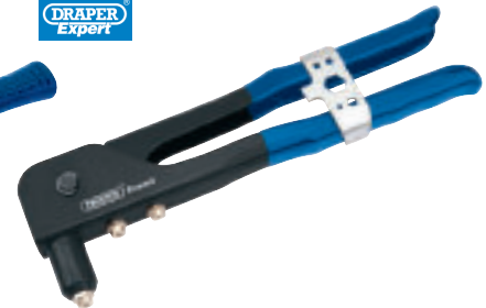
3 263A RIVETER

Expert Quality. carbon steel riveter. Supplied with nozzle wrench for use with the three interchangeable nozzles, which accept 3.2, 4.0 and 4.8mm alloy and steel rivets. Display packed.