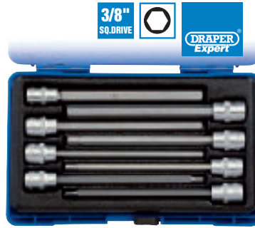
2 D-HEX/8/150 3/8" Sq. Dr. HEXAGONAL SOCKET BIT SETS (8 PIECE)

Expert Quality , 8 sockets fitted with hexagonal bits. All sockets manufactured from hardened and tempered chrome vanadium steel with sand blasted bits of S2 silicon steel. Each socket has a knurled ring for extra grip. Supplied in a plastic storage case. Display packed. Contents: H3, H4, H5, H6, H7, H8, H10, H12