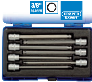
1 D-HEX-B/7/150 3/8" Sq. Dr. HEXAGONAL SOCKET BIT SETS (7 PIECE)

Expert Quality , 7 sockets fitted with ball end hexagonal bits. All sockets manufactured from hardened and tempered chrome vanadium steel with sand blasted bits of S2 silicon steel. Each socket has a knurled ring for extra grip. Supplied a plastic storage case. Contents: H3, H4, H5, H6, H7, H8, H10