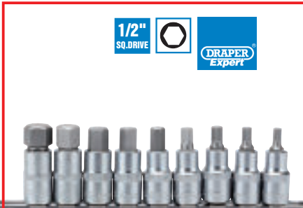
4 H-HEX/9/55 1/2" Sq. Dr. METRIC HEXAGONAL SOCKET BIT SETS (9 PIECE)

Expert Quality , 9 sockets fitted with hex insert bits. All sockets manufactured from hardened and tempered chrome vanadium steel with sand blasted bits of S2 silicon steel. Each socket has a knurled ring for extra grip. Supplied on a steel socket retaining rail. Display packed. Contents: H6, H7, H8, H9, H10, H12, H14, H17, H19