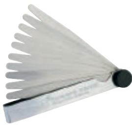
4 4617B 10 BLADE METRIC FEELER GAUGE SET

100mm long taper blades. Each blade is marked with its size and folds into a plated steel case with thumbscrew. Display packed.