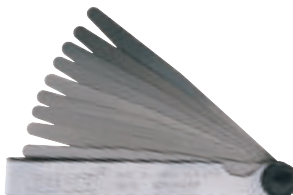
5 4616B 10 BLADE IMPERIAL FEELER GAUGE SET

100mm long taper blades. Each blade is marked with its size and folds into a plated steel case with thumbscrew. Display packed.