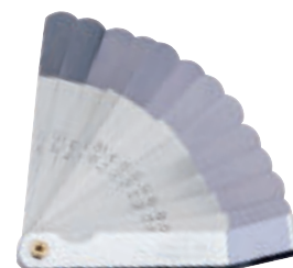
8 VTG12B 12 BLADE COMBINATION TAPPET GAUGE SET

Combination gauge for the setting of valve tappets on motorcycles, mowers, cars, vans, etc. The dual marked blades are 95mm long and offset to give improved access to the engine and are hardened and polished for long accurate life. Each blade is marked with its size and folds into a polished steel case with thumbscrew. Display packed.