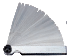
3 4620B 32 BLADE COMBINATION FEELER GAUGE SET

Combination gauge 32 dual marked 100mm blades, hardened and polished for long accurate life. Each blade is marked with its size and folds into a plated steel case with thumbscrew. Display packed.