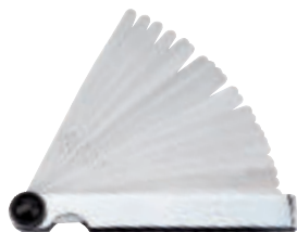
2 26FB 26 BLADE IMPERIAL FEELER GAUGE SET

100mm long taper blades, hardened and polished for long accurate life. Each blade is marked with its size and folds into a polished steel case with thumbscrew. Display packed.