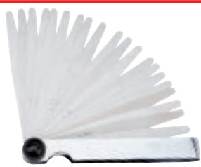
1 600CB 20 BLADE METRIC FEELER GAUGE SET

100mm long taper blades, hardened and polished for long accurate life. Each blade is marked with its size and folds into a polished steel case with thumbscrew. Display packed.