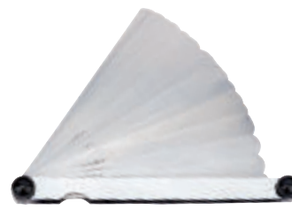
7 FG26/LRB 26 BLADE EXTRA LONG COMBINATION FEELER GAUGE SET

Combination gauge with 26 dual marked 150mm long blades, hardened and polished for long accurate life. Each blade is marked with its size and folds into a plated steel case with thumbscrew. Display packed.