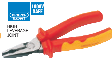
2 63AHLVDE 200mm VDE APPROVED FULLY INSULATED HIGH LEVERAGE COMBINATION PLIERS

Manufactured to DIN Standard and individually certified to EN 60900