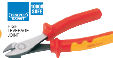
3 41AHLVDE VDE APPROVED FULLY INSULATED HIGH LEVERAGE DIAGONAL SIDE CUTTERS

Manufactured to DIN Standard and individually certified to EN 60900