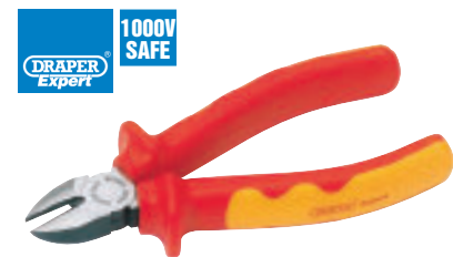
4 41AVDE VDE APPROVED FULLY INSULATED DIAGONAL SIDE CUTTERS

Manufactured to DIN Standard and individually certified to EN 60900