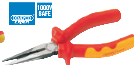
6 36AVDE VDE APPROVED FULLY INSULATED LONG NOSE PLIERS

Manufactured to DIN Standard and individually certified to EN 60900