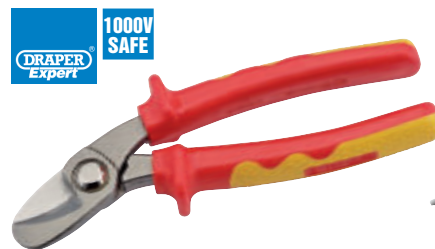
5 73AVDE VDE APPROVED FULLY INSULATED CABLE SHEARS (180MM)

Manufactured to DIN Standard and individually certified to EN 60900