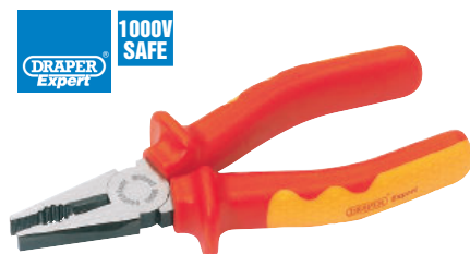
1 63AVDE VDE APPROVED FULLY INSULATED COMBINATION PLIERS

Ergonomical soft grip feature for comfort