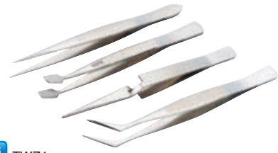
3 TWZ4 TWEezer SET (4 PIECE)

Comprising 114mm long straight; 120mm curved; 105mm spade and 114mm self closing. Manufactured from stainless steel. Display packed.