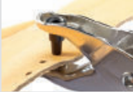
Punch a hole through the material.