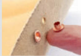
Push the eyelet through the hole.