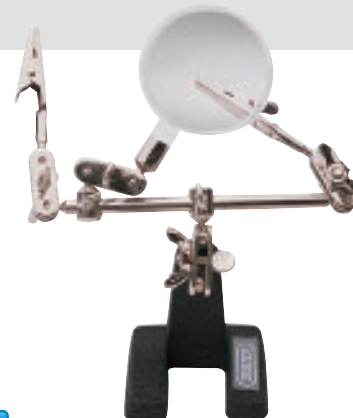
6 HH HELPING HAND BRACKET

Useful bracket suitable for electronic work, model and jewellery making. Complete with fully adjustable holding clips and a 60mm diameter glass magnifying lens (x 2.0 magnification). The solid cast base improves stability. Display packed.