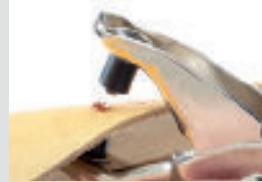
Then place the ready side of the eyelet in the former and squeeze together.